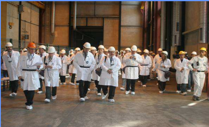
Pierrelatte enrichment plant

Participants visited the former uranium enrichment plant at Pierrelatte and one of the three plutonium-producing reactors and the military reprocessing plant at Marcoule. They were able to see that France's 1996 decision to cease all production of fissile material for its nuclear weapons and dismantle its dedicated production facilities at Pierrelatte and Marcoule had been concretely and effectively implemented.